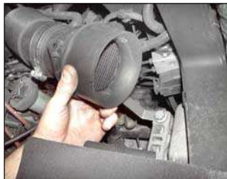
Fig. # 14