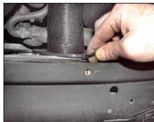
Fig. # 19