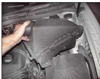
Fig. # 5