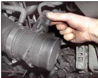
Fig. # 13