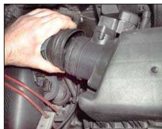
Fig. # 2