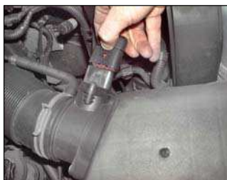
Fig. # 1

WARNING: Before starting the engine carry out a final fitment check of the K&N performance kit. It will be necessary for all intake systems to be checked periodically for realignment, clearance and tightening of all connections. Failure to follow the above instructions or proper maintenance may void the warranty.