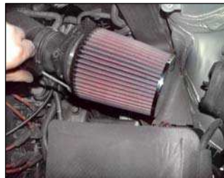
Fig. # 15