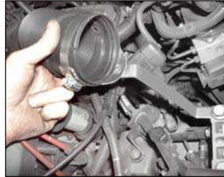
Fig. # 11