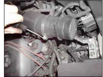
Fig. # 12