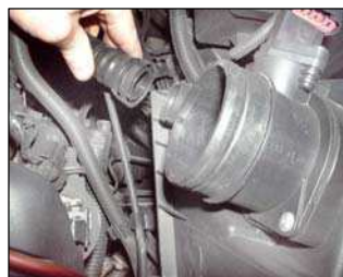
Fig. # 3