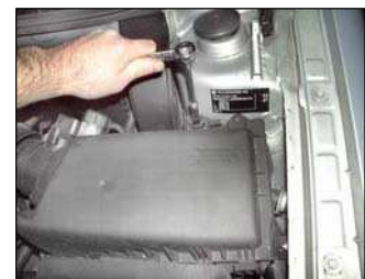
Fig. # 4