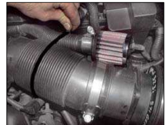
Fig. # 16