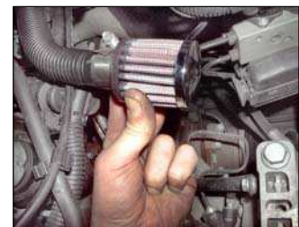
Fig. # 8