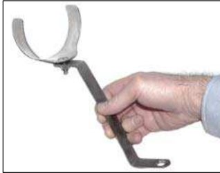
Fig. # 9