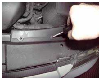
Fig. # 18