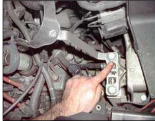
Fig. # 10