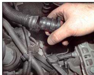
Fig. # 7