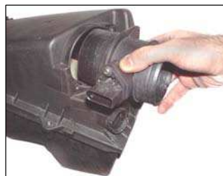
Fig. # 6