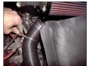
Fig. # 20