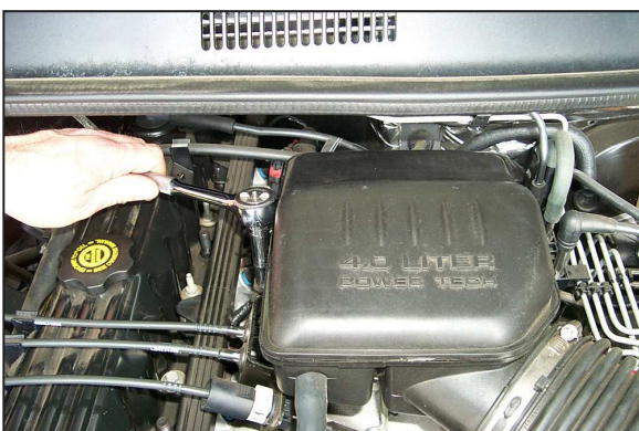
3. Loosen the bolt on the resonator as shown.