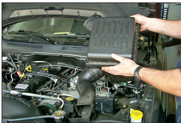
5. Remove the three nuts that secure the air cleaner assembly from underneath the vehicle, then, remove the air cleaner assembly as shown. NOTE: K&N Engineering, Inc., recommends that customers do not discard factory air intake.