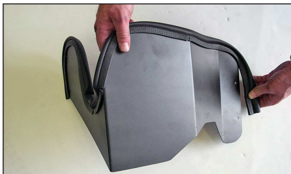
6. Install the provided trim seal onto the heat shield as shown. Trim if needed.