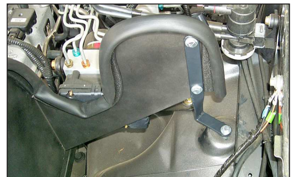
8. Install the heat shield into the vehicle and secure the twist bracket to the original air cleaner mounting hole using the provided hardware.