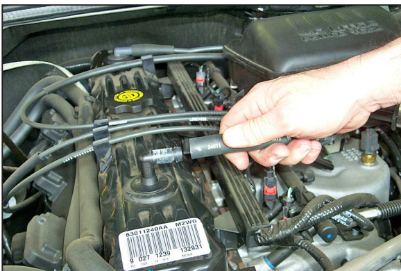
2. Disconnect the crank case vent hose as shown.

1. Turn off the ignition and disconnect the negative battery cable. NOTE: Disconnecting the negative battery cable erases pre-programmed electronic memories. Write down all memory settings before disconnecting the negative battery cable. Some radios will require an anti-theft code to be entered after the battery is reconnected. The anti-theft code is typically supplied with your owner's manual. In the event your vehicles' anti-theft code cannot be recovered, contact an authorized dealership to obtain your vehicles anti-theft code.