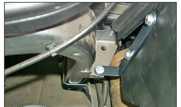
9. Secure the "L" bracket to the hole on the flange/tab on the radiator core support using the provided hardware.