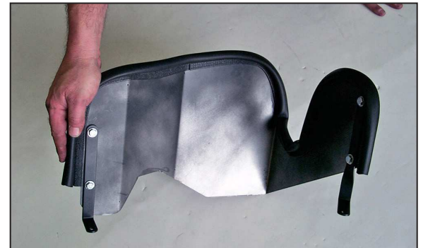
7. Using the provided hardware install the two brackets onto the heat shield as shown.