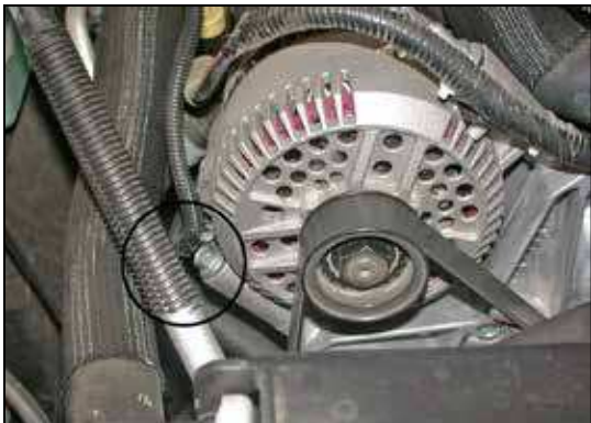
17. Remove the front lower alternator mounting bolt shown.