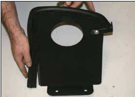
20. Install the provided edge trim onto the heat shield as shown.