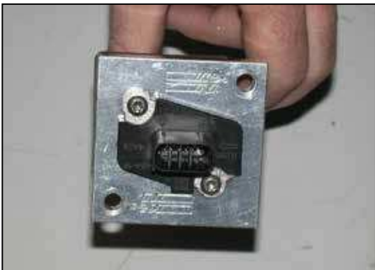
13. Using the factory mounting screws, install mass air sensor into the K&N® adapter assembly as shown.