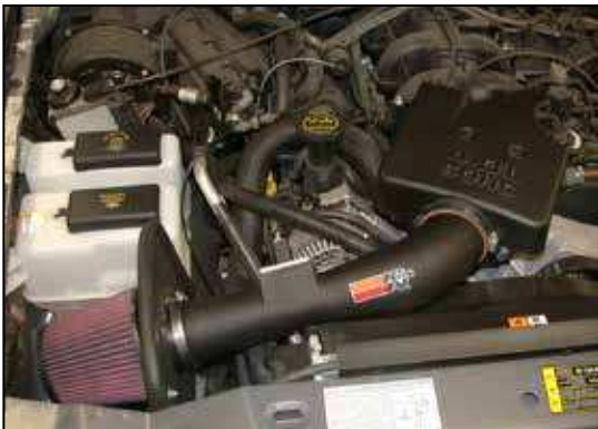
27. Reconnect the vehicle's negative battery cable. Double check to make sure everything is tight and properly positioned before starting the vehicle.

28. The C.A.R.B. exemption sticker, (attached), must be visible under the hood so that an emissions inspector can see it when the vehicle is required to be tested for emissions. California requires testing every two years, other states may vary. 29. It will be necessary for all K&N® high flow intake systems to be checked periodically for realignment, clearance and tightening of all connections. Failure to follow the above instructions or proper maintenance may void warranty.