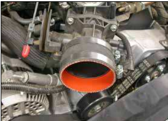
10. Install the silicone hose (08630) onto the throttle body and secure with the provided hose clamp.