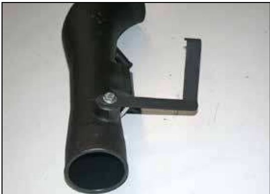
16. Install the provided tube-mounting bracket (010081) onto the K&N® intake tube with the provided hardware as shown.