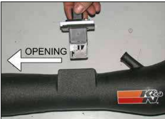
14. Install the mass air sensor assembly into the K&N® intake tube as shown. NOTE: Make sure the open end of the sensor is towards the filter end of the tube.