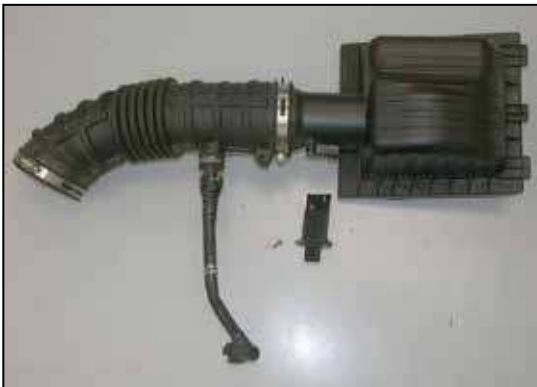
11. Using the "TORX" wrench provided, remove the mass air sensor from the stock airbox assembly as shown.