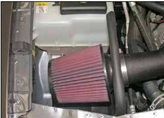
25. Install the air filter and secure with hose clamp provided.