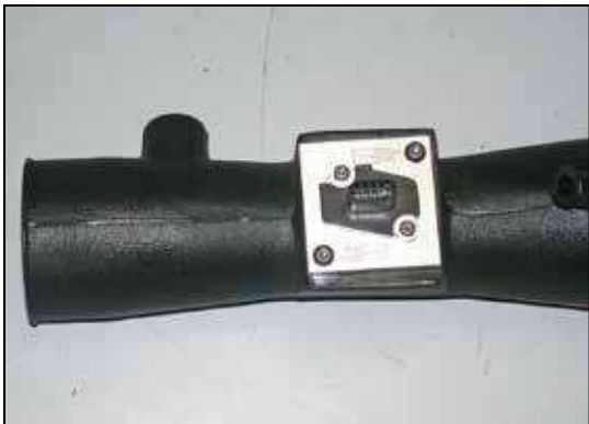
15. Secure the mass air assembly onto K&N® intake tube using the hardware provided as shown.