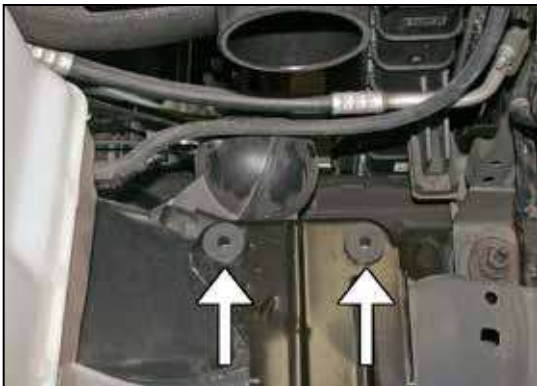
21. Install the two provided threaded inserts into the lower airbox mounting plate at shown.