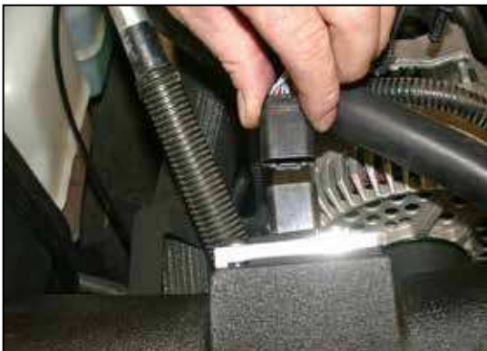
24. Reconnect the mass air sensor electrical connection.