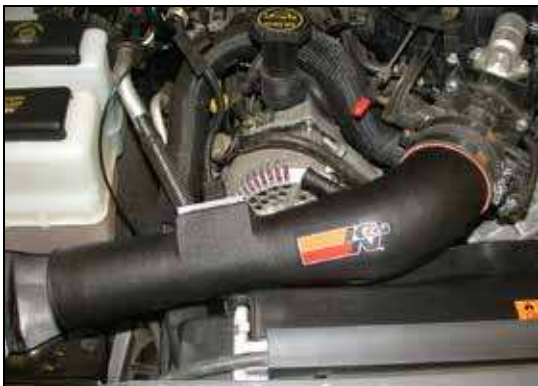
18. Install the K&N® intake tube into the silicone hose at the throttle body and secure the bracket in place on the alternator with the bolt removed in step #17.