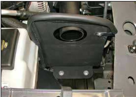
22. Install the heat shield assembly into the vehicle so the bracket lines up with the factory in the core support and the heat shield holes line up with the threaded inserts installed in step #21.