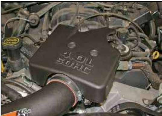
26. Reinstall the engine cover and secure with the factory mounting bolts.