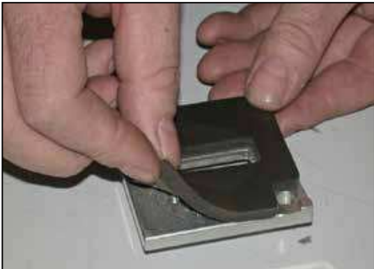
12. Install the provided gasket onto the K&N® mass air adapter as shown. Sticky side down.