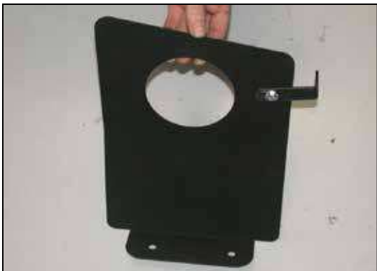
19. Install the heat shield mounting bracket (070742) onto the heat shield with the provided hardware as shown.