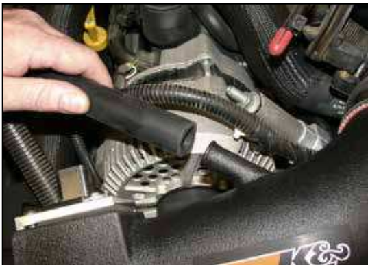
23. Install the provided crankcase vent hose onto the fitting at the valve cover then attach the other end to the port on the K&N® intake tube.