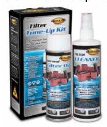
P/N 790-551 Aerosol Spray P/N 790-550 Squeeze Spray