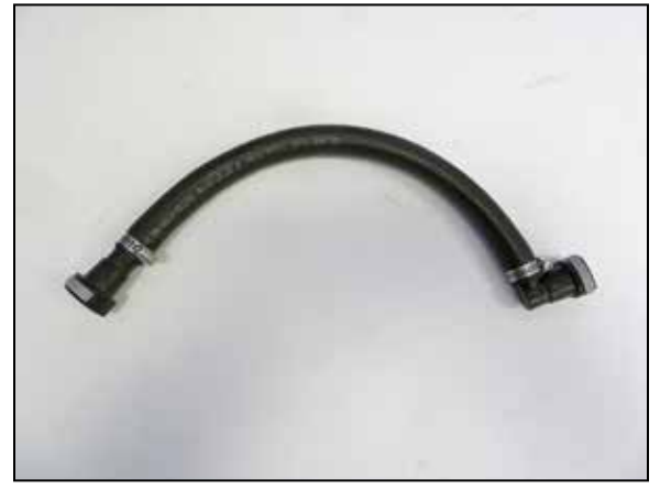
10. Assemble the crank case hose assembly as shown