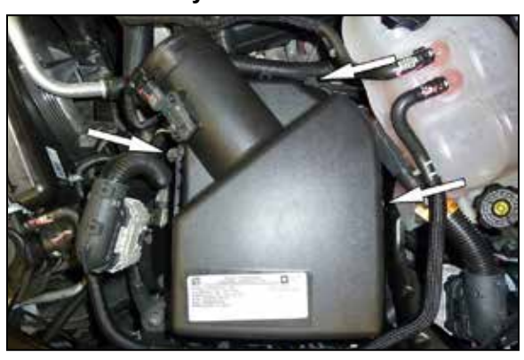
Loosen the three screws that secure the air filter housing lid and then lift up the housing and set aside.

NOTE: AIRAID® recommends that customers do not discard factory air intake.