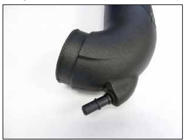
8. Install the provided grommet and quick connect fitting into the AIRAID® intake tube as shown.