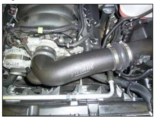
9. Install the AIRAID® intake tube into the hump coupler and then the coupler at the throttle body, adjust the tube for best fit and secure with the provided hose clamps.