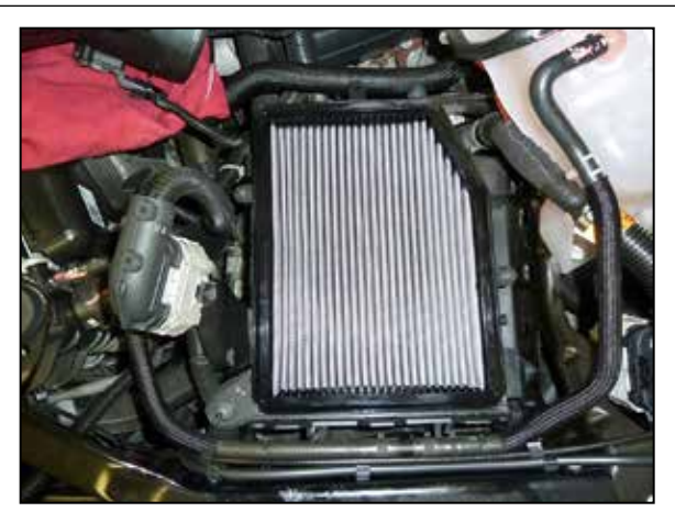
5. Remove the factory air filter and replace with the AIRAID® air filter provided. Reinstall the air filter housing lid and secure with the factory screws.