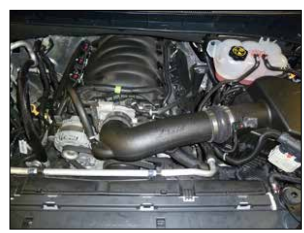
12. Double check your work! Make sure there is no foreign material in the intake path. Make sure all clamps, hoses, bolts, and screws are tight. Double check the hood clearance! Reconnect the negative battery cable!

13. NOTE: Most General Motors vehicles have the Vehicle Emissions Certification Information (VECI) label affixed to the air filter box. In order to be compliant with California emissions laws, the label MUST remain in the engine compartment. If the Vehicle Emission Control Information label is removed during modification, a new replacement label must be obtained and installed in a readily visible position in the engine compartment. The label shall not be affixed to any equipment which is easily detached from the vehicle. We recommend that the label is affixed to the underside of the hood adjacent to the hood latch. The label is Vehicle Identification Number dependent and can be ordered from the vehicle dealership. In order to receive the proper decal please bring your VIN with you. Failure to have the VECI under the hood may result in failure of a pre-registration smog test.