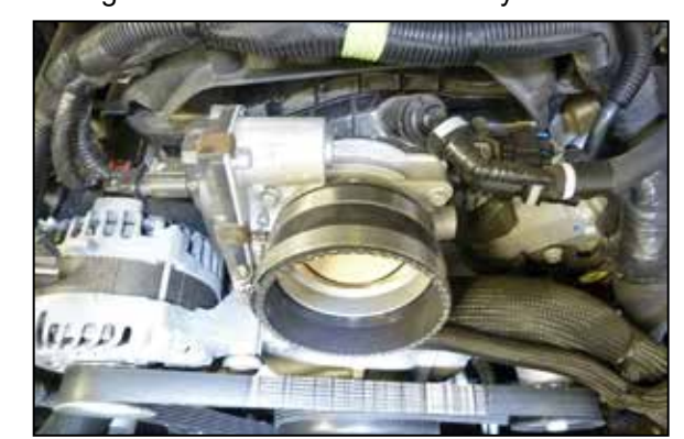
6. Install the provided coupler onto the throttle body. 5.3L engines will use the smaller coupler and 6.2L engines will use the larger coupler.