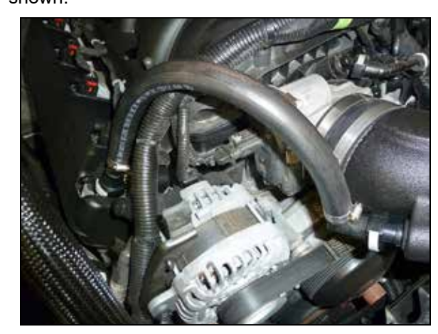
11. Install the crank case hose assembly onto the quick connect fittings on the intake tube and valve cover as shown.