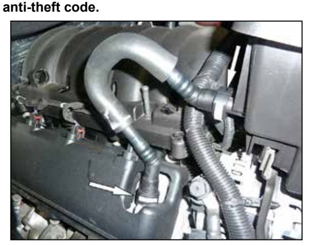
2. Depress the locking tabs and then remove the crank case vent hose assembly.

NOTE: Disconnecting the negative battery cable erases pre-programmed electronic memories. Write down all memory settings before disconnecting the negative battery cable. Some radios will require an anti-theft code to be entered after the battery is reconnected. The anti-theft code is typically supplied with your owner's manual. In the event your vehicles anti-theft code cannot be recovered, contact an authorized dealership to obtain your vehicles