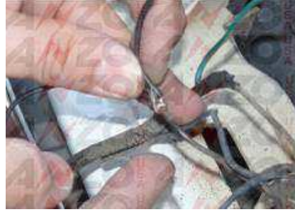
Step 15: splice in the black (-) wire into the black parking light wire from step 3