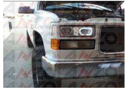
Step 19: Test all functions before driving.

AnzoUSA™ products are covered, by a limited one (1) year warranty, to be free of manufacturer's defects. However, certain AnzoUSA™ product categories have warranty policies which differ from this standard, please contact your representative for detailed category information. Damage due to improper installation or road hazards is not covered. Seller and manufacturers' only obligations shall be to replace the product proven to be defective. Neither seller nor manufacturer shall be liable for any injury, loss or damage, direct or consequential, arising out of the use of or the inability to use the product. Before using, user shall determine the suitability of the product for its intended use, and user assumes all risk and liability whatsoever in connection therewith.