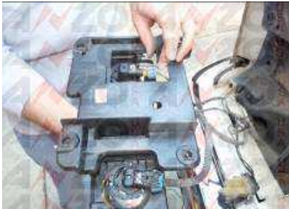
Step 14: Plug in the wire harness for the new Anzo head light.