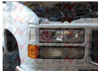
Step 18: Reverse steps to replace the headlights, grill and parking lights.