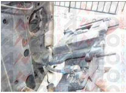
Step 11: Pull the headlight away from the vehicle.