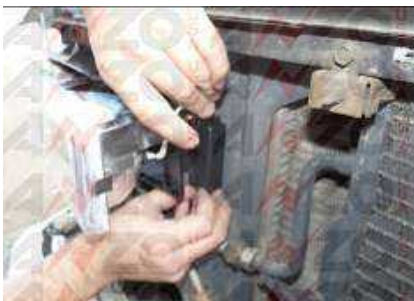
Step 17: Place the resistor box next to the headlight where space is available.