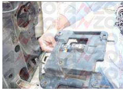
Step 12: Unplug the wire harness for the head light.