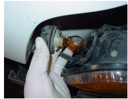
Step 11: Plug in the corner light.