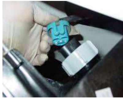
Step 10: Put in the new Anzo light and plug in the headlight harness.