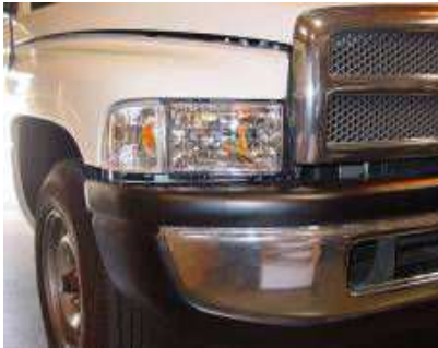
Step 12: Bolt on the headlight and check all functions before driving.