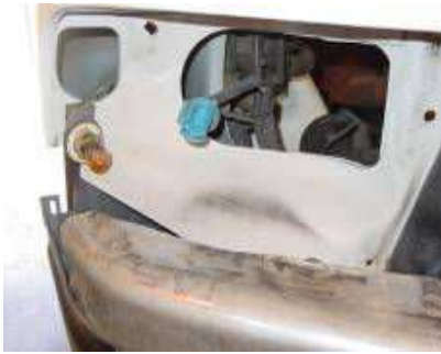
Step 9: Remove the headlight from the car.