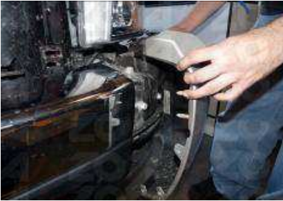
Step 12: Pull off the bumper cover from the frame of the vehicle.