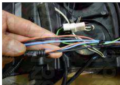
Step 18: Locate the 2 light tan and black wire from the Anzo headlight does not matter which ones you use.