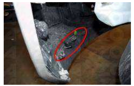
Step 11: Unclip the three pins holding in the bumper cover and the lip.