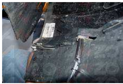
Step 10: Remove the 10mm screw holding in the lip to the bumper cover.