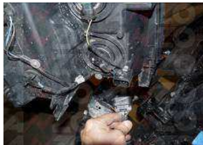
Step 16: Unplug the wire harness from the headlight.