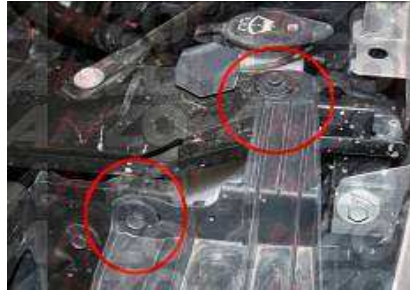
Step 13: Remove the two 10mm screws holding the headlight in place.