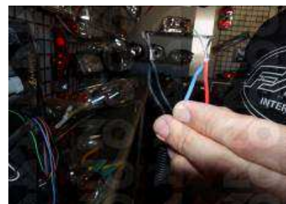
Step 19: Twist the red and blue wires together and the two blacks together from the new headlight.