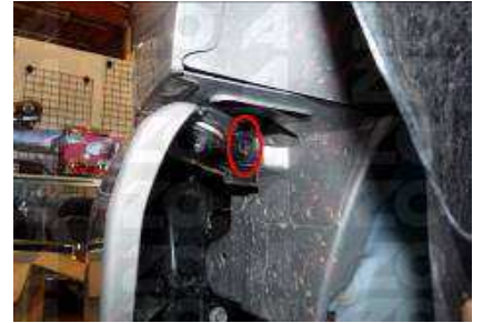
Step 14: Pull back the wheel well cover to remove the 10mm socket holding the headlight in place.