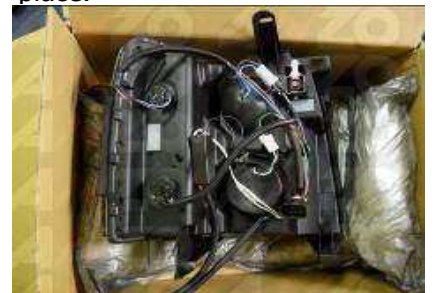
Step 17: Take out the new Anzo headlight from the box.