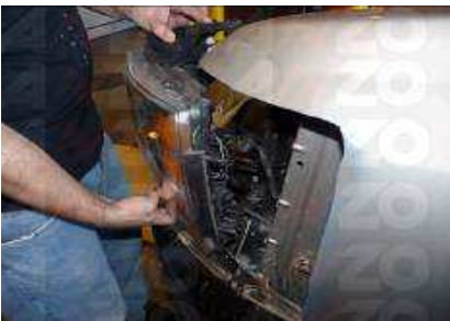
Step 15: Remove the headlight from the vehicle.