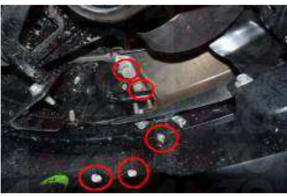
Step 9: Get under the vehicle under the bumper cover to remove the five 10mm screws.