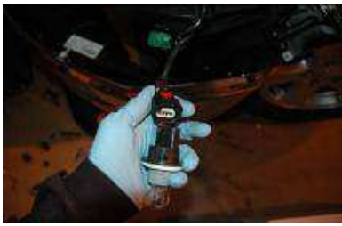
Unclip the parking bulb from wire harness.