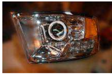
Take out the new projector halo led headlight from the box.