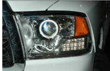
Test all functions before driving.