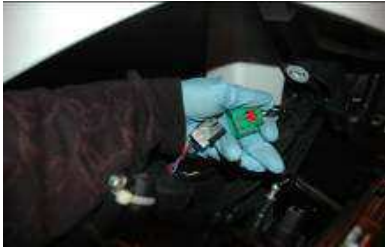
Re-clip the headlight wire harness into the new headlight.