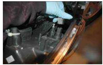
Re-clip the parking light socket into the new headlight.