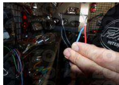
Step 19: Twist the red and blue wires together and the two blacks together from the new headlight.