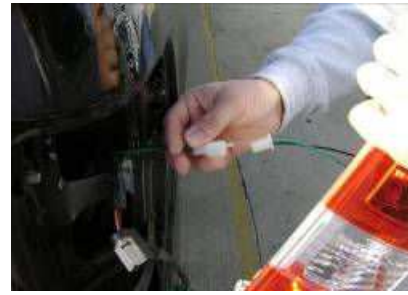
Step 8: Plug the resistor to the taillight.