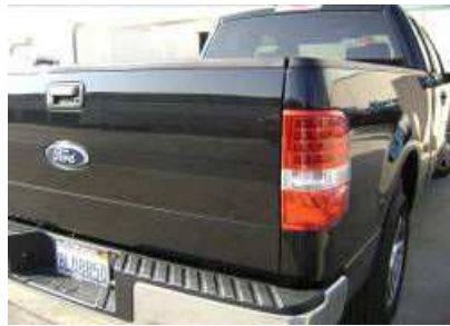
Step 10: Make sure all functions are working properly before driving.

AnzoUSA™ products are covered, by a limited one (1) year warranty, to be free of manufacturer's defects. However, certain AnzoUSA™ product categories have warranty policies which differ from this standard, please contact your representative for detailed category information. Damage due to improper installation or road hazards is not covered. Seller and manufacturers' only obligations shall be to replace the product proven to be defective. Neither seller nor manufacturer shall be liable for any injury, loss or damage, direct or consequential, arising out of the use of or the inability to use the product. Before using, user shall determine the suitability of the product for its intended use, and user assumes all risk and liability whatsoever in connection therewith.