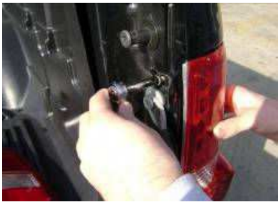
Step 9: Install the taillight in to the housing of the truck using the two 8mm. Screws.