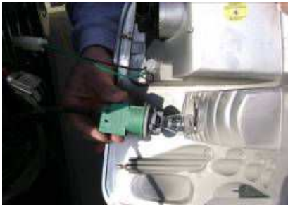
Step 6: Install the green socket into the ANZO taillight assembly.