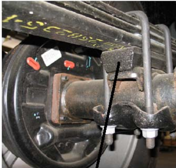
TOP SPACER BLOCK