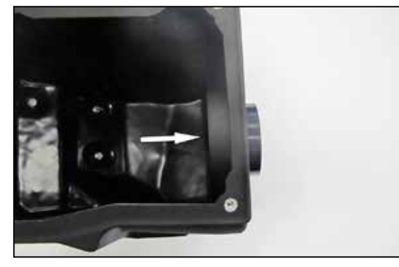
8. Install the provided filter adapter into the housing and secure with the provided hardware.