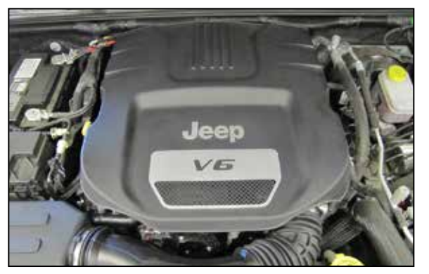
2. Lift up the engine cover to dislodge it from the mounting studs and then remove the cover from the engine.

3. Remove the two bolts that secure the factory intake tube to the fan shroud.