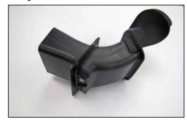
10. Install the provided fresh air scoop mounting bracket onto the fresh air scoop and secure with the provided hardware.