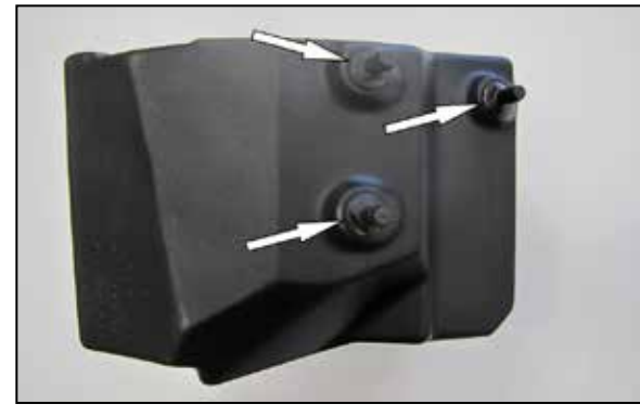
7. Install the three mounting studs provided onto the K&N ^{\odot} air filter housing using the provided hardware.