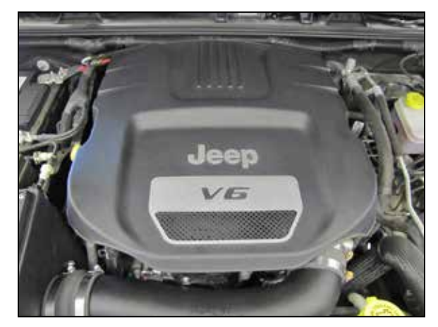
23. Reinstall the engine cover.