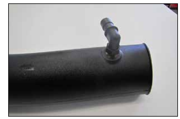
15. Install the provided 90° fitting into the K&N®

NOTE: The inlet air temperature sensor is very fragile, use caution while handling the sensor.