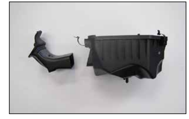
9. Using a 1/8" drill, drill out the two rivets that secure the factory fresh air duct to the factory air filter housing and then remove the duct from the housing as shown.