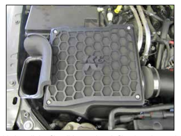
22. Install the filter lid onto the air filter housing and secure with the provided hardware. NOTE: A foam insert has been provided to use in the fresh air intake duct during extreme conditions.