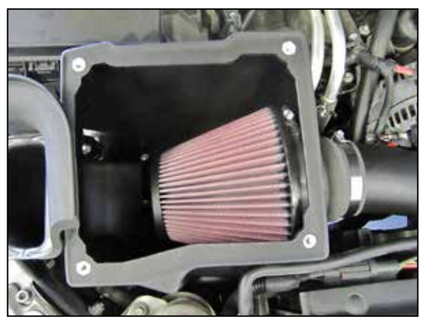
20. Install the K&N<sup>®</sup> air filter onto the adapter and secure with the provided hose clamp.

19. Install the "L" brackets onto the fan shroud using the provided hardware and then secure the coolant hose with the tie wraps.