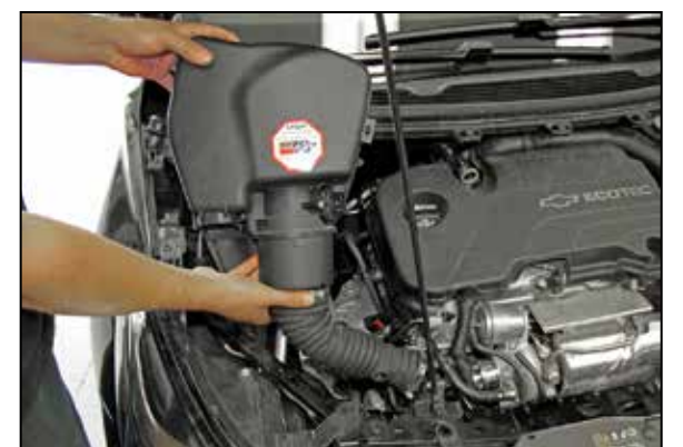
6. Lift up and remove the complete stock intake system from the vehicle. NOTE: K&N Engineering, Inc., recommends that customers do not discard factory air intake.