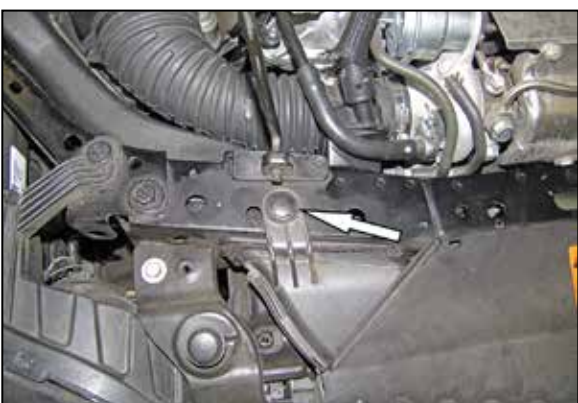
2. Remove the retaining pin the secures the fresh air intake duct.

1. Turn off the ignition and disconnect the negative battery cable. NOTE: Disconnecting the negative battery cable erases pre-programmed electronic memories. Write down all memory settings before disconnecting the negative battery cable. Some radios will require an anti-theft code to be entered after the battery is reconnected. The anti-theft code is typically supplied with your owner's manual. In the event your vehicles anti-theft code cannot be recovered, contact an authorized dealership to obtain your vehicles anti-theft code.