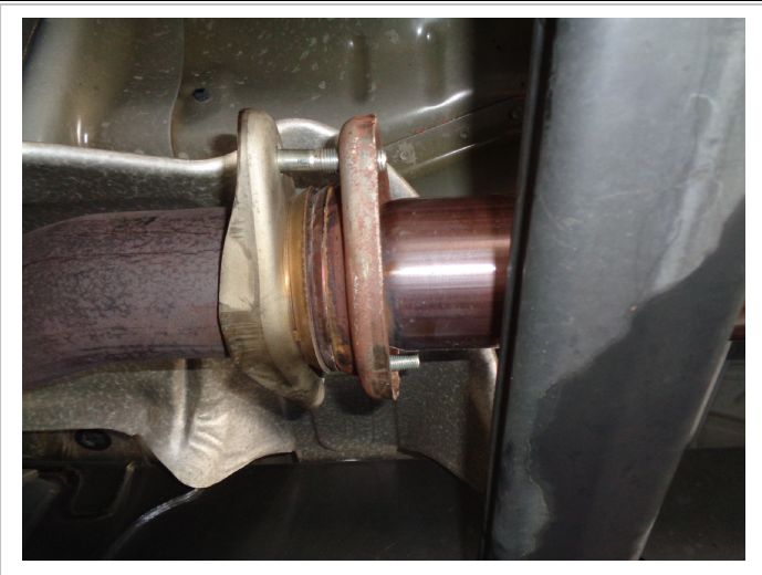
Step 1. To remove the OEM exhaust system, you will need to unbolt the muffler assembly from the flange junction as shown.