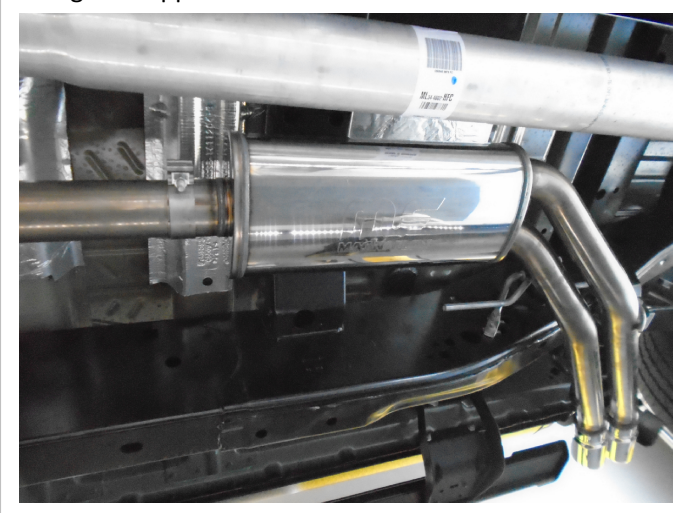
Step 6. Install the Muffler Assembly and loosely secure using the supplied 3.00" clamp. Attach the installed Hanger Bracket Assembly to the welded hanger using the supplied rubber insulator.

Step 5. Locate the two square holes in the passengers side of the vehicles subframe. Attach the two supplied U-Type panel nuts as shown in the diagram. Losely bolt the supplied Hanger Bracket Assembly to the panel nuts using the supplied bolts.