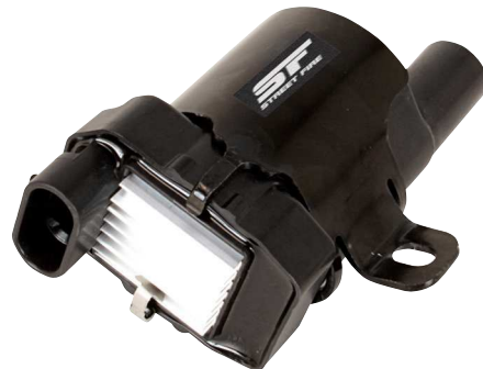
L-Series Truck '99-'07, PN 5509/PN 55098