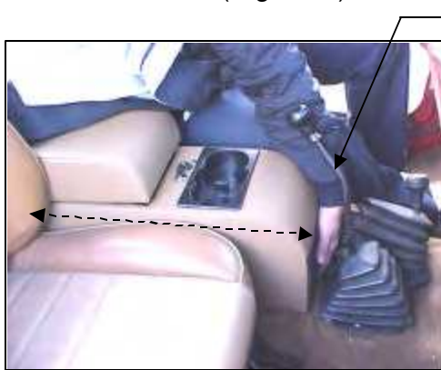
Figure 3 (13101.xx console shown)