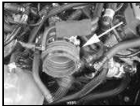
Step 13 Install the flex coupler over the throttle body and secure with a supplied clamp. Install a second clamp but do not tighten at this time.