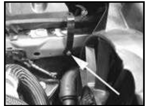
Step 11 Using the supplied hardware, install the "L" bracket onto the frame using the hole that is threaded. This is located towards the front of frame on the driver's side.