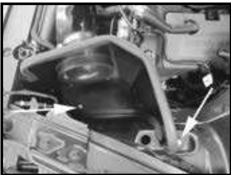
Step 12 Install the heat shield and secure it using the supplied hardware. Fully tighten all mounting hardware.