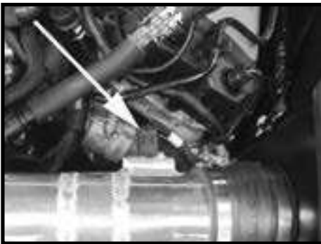
Step 18 Connect the wire extension harness into the MAFS harness on the vehicle then connect the harness to the MAFS connector by pushing the connector on the sensor. Once bottomed out push the red clip towards the tube to lock in place.