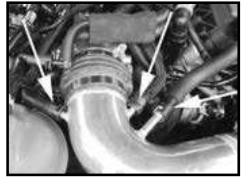
Step 17 Reconnect the factory vent lines to the intake tube.