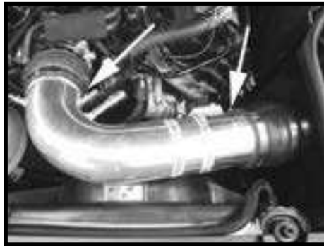
Step 16 Install the intake tube. Once in the desired location and everything fits in place, tighten the clamps.