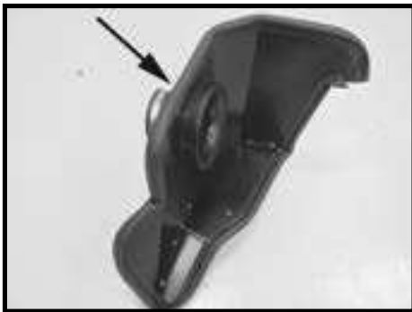
Step 10 Assemble the heat shield with the tabs placed on the outside of the heat shield (side with arrow). Place the velocity stack adapter in the heat shield and install the supplied reducer coupler making sure the coupler is pushed completely against the heat shield. Once the adapter and coupler are tight against the heat shield, tighten the clamp. Make sure that the clamp for the intake tube is installed but left loose at this time. Dress the heat shield with rubber seal as shown. This may require trimming to the correct length.