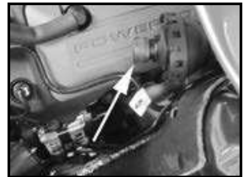
Step 14 Install the cap plug on the valve.