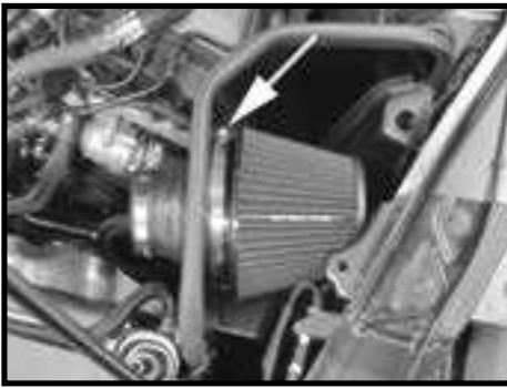
Step 15 Install the filter and securely fasten to the velocity stack adaptor.