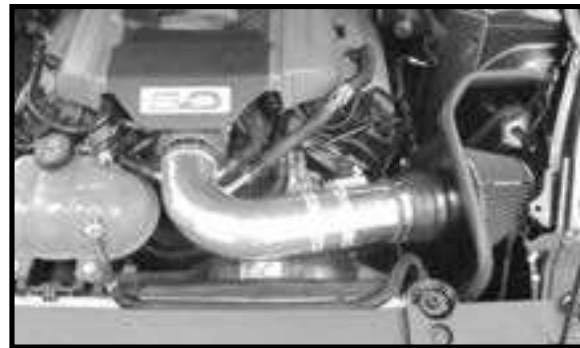
Step 19 Reinstall the engine cover. Make sure that all clamps and hardware are fully tightened. Reconnect the battery cable, start the vehicle and let it warm up. Shut off and inspect the installation once more for any loose clamps, wires, or hardware. Test drive & enjoy! Your installation is now complete. Periodically check all clamps and brackets.

If you need any assistance please call 1-800-858-3333 to speak with a representative in our Customer Service Center before returning the product.