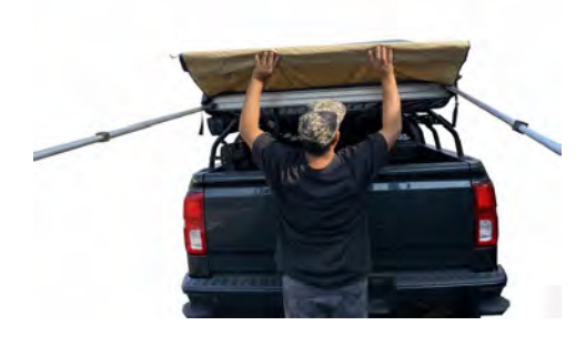
STEP 6 Roll out Awning

Lock Horizontal poles in place by twisting the rod.